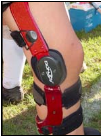
They come in different colors!

As it has no sharp edge or point and is no more dangerous than an athlete's unpadded knee, elbow, head or cleats—let alone a hockey stick or hockey ball—it is okay to play with this brace without covering or padding.